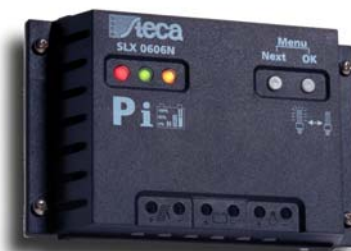
SLX 0606 Night